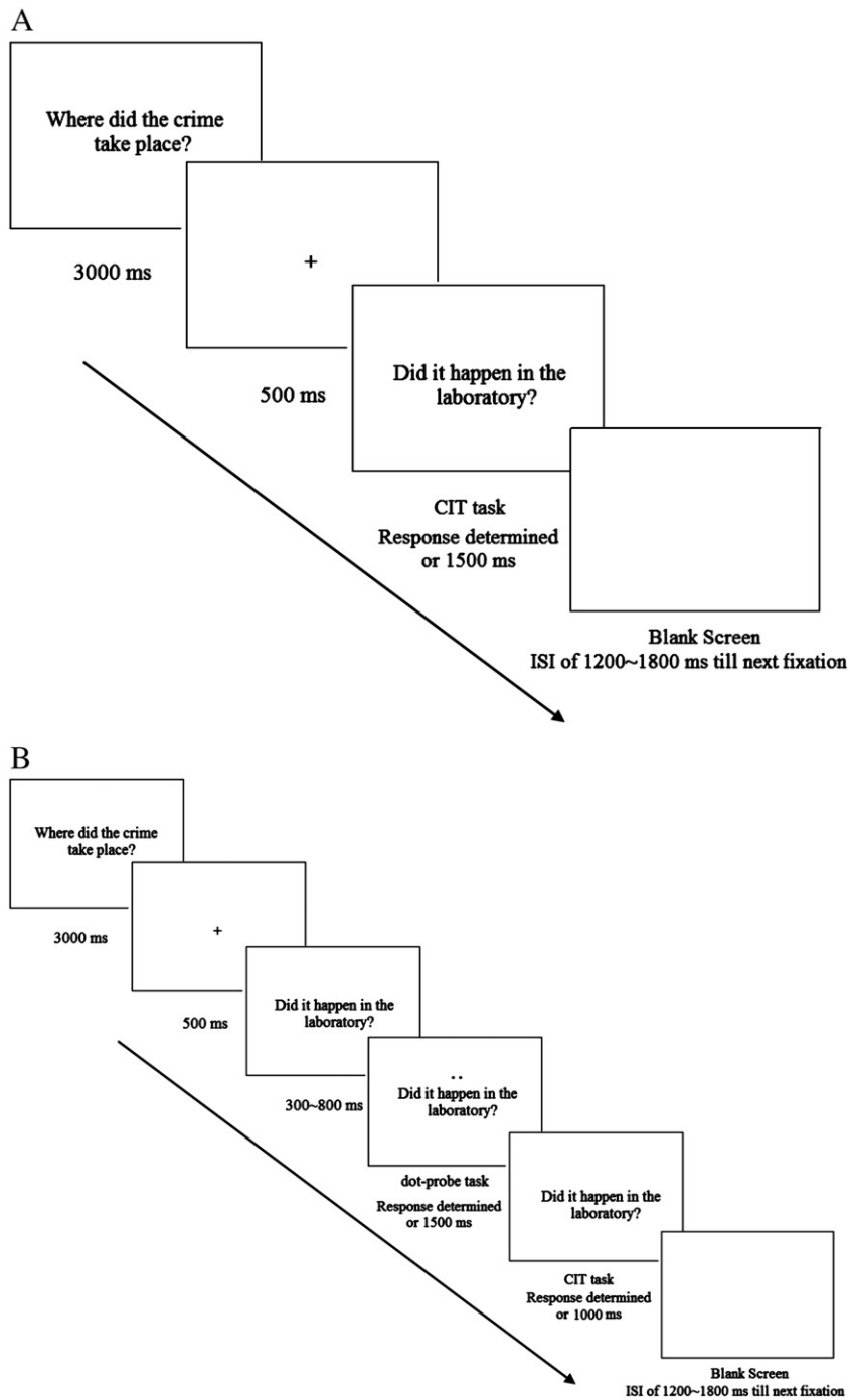
Fig. 1. A: Task structure of the pure RT-based CIT task. B: Task structure of the interference RT-based CIT task.

phase, the CIT-without-interference phase, and the CIT-interference phase. Participants in the innocent group did not experience a mock crime. They just completed the target word study phase, the CIT-without-interference phase, and the CIT-interference phase. The order of the last two CIT tasks was counterbalanced between participants.